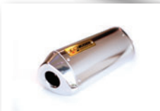
Supplied with limited edition exhaust.