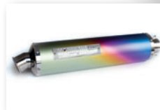
Supplied with limited edition exhaust for racetrack use.